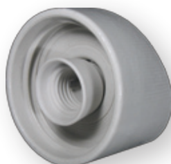
Porcelain lampholder E 27-204