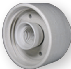
Porcelain lampholder E 27-203